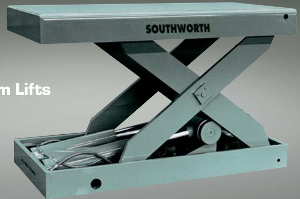
L Series Cam Lifts

Exclusive CAM design provides maximum capacities (up to 30,000 lbs.) with minimum height clearances.