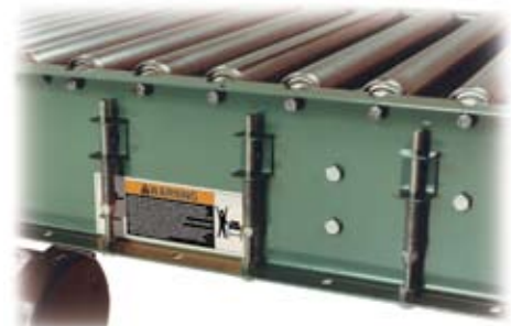
VARIABLE PRESSURE ADJUSTMENT

ELECTRICAL CONTROLS: Magnetic starter (one direction or reversible); One direction manual starter; Momentary start/stop push button station; Forward/reversing /stop push button station. Mounting and pre-wiring for units up to 12' long.