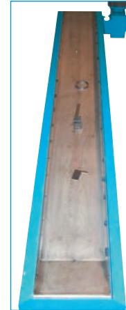
Full length front view photo