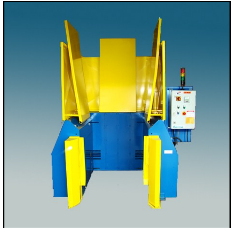
Automatic Pallet Dispenser Model 50-57J

A single pallet is automatically removed from the bottom of the stack and positioned on the floor. Using a pallet jack, the pallet is then unloaded from the machine. The operation can be reversed, stacking the pallets in a magazine. The entire stack can then be unloaded with a pallet jack.