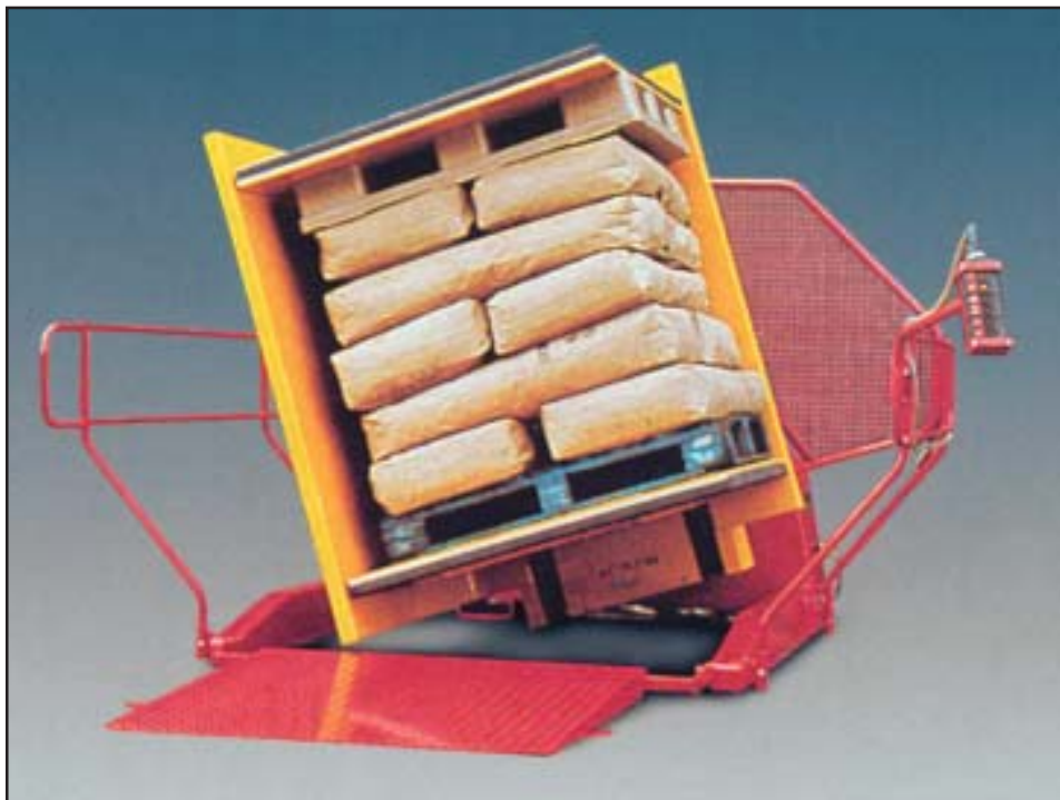
FDL Pallet Inverter Rotates Load 180°