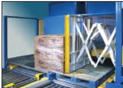
Push Plate Transfers Product from Pallet to Stripper Plate

The RM-1150 is a basic and reliable system designed to transfer cases and combo boxes from one type of pallet to another for shipping, storage, or to meet in house production requirements. The system utilizes a pallet dispenser and stacker to minimize pallet handling.