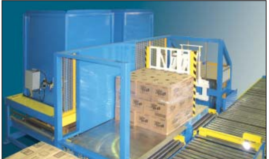
RM-1150 Pallet-To-Pallet Load Transfer System with Pallet Dispenser, Stacker, Infeed and Discharge Conveyors