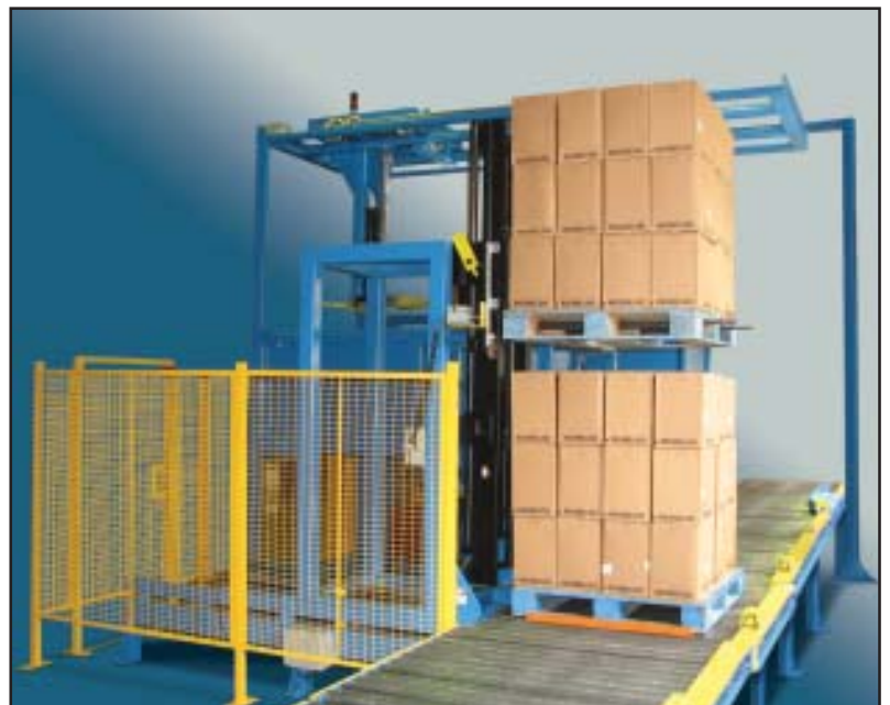
RM-1250 Stacks Cased Food Products on Chep Pallets