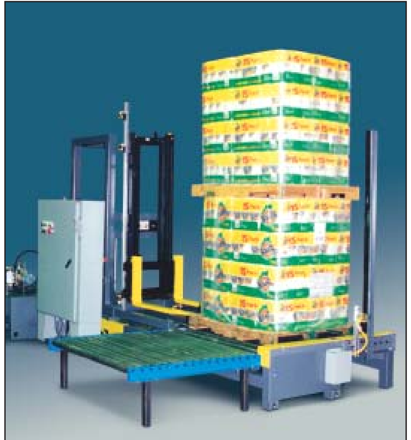
RM-1250 Stacks Paper Products on GMA Pallets

Palletized product is received and positioned for stacking with a power roller conveyor. Forks extend into pallet and lift load for stacking. With a second pallet in position under the first, the suspended load is then lowered and double stacked. The stacked product is discharged onto the customer's conveyor.