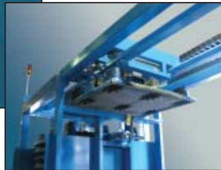
Detail of four clamp assembly

The RM-995 utilizes four clamp assemblies to secure the edges of pallet or board. Guided cylinder installed motorized carriage then lifts and transfers the pallets to the main line conveyor for palletizing.