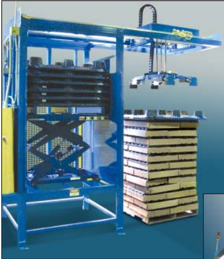
RM-995 Places Plastic Pallet