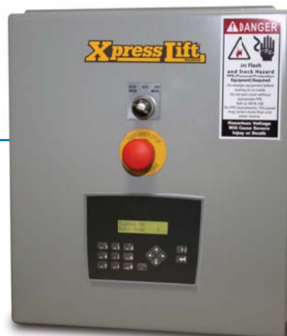
“All-In-One” Controller with Intuitive Text Display