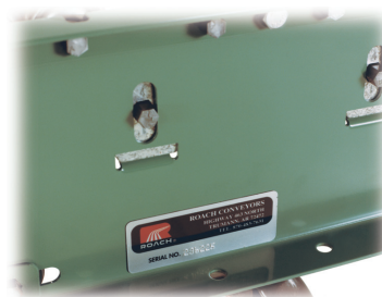
CALR CAM AND SERIAL PLATE