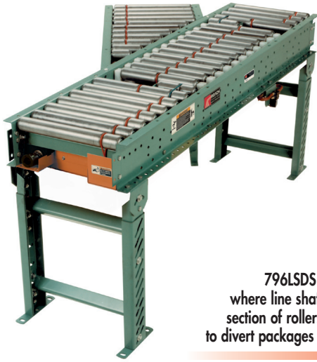
Conveyor shown with optional supports

796LSDS is used in diverging applications where line shaft conveyor is suitable. The pivot section of rollers, pneumatically actuated, skews to divert packages onto spur quickly and efficiently.