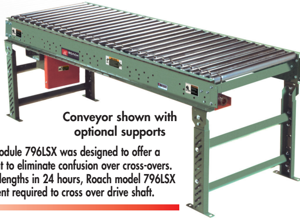
Conveyor shown with optional supports

24 HOUR SHIPMENTS INCLUDE ALL 1-FOOT INCREMENTS 2'-0" TO 10'-0"