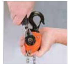
Perform just like larger hoists, but small enough to fit in the palm of your hand.