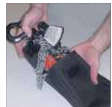
Convenient Carry Bag