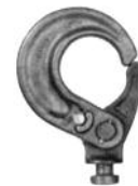
Optional upper Latchlok Hook 3/4 - 1 1/2 ton