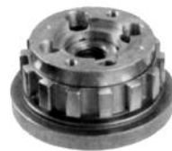
Optional Load Limiter