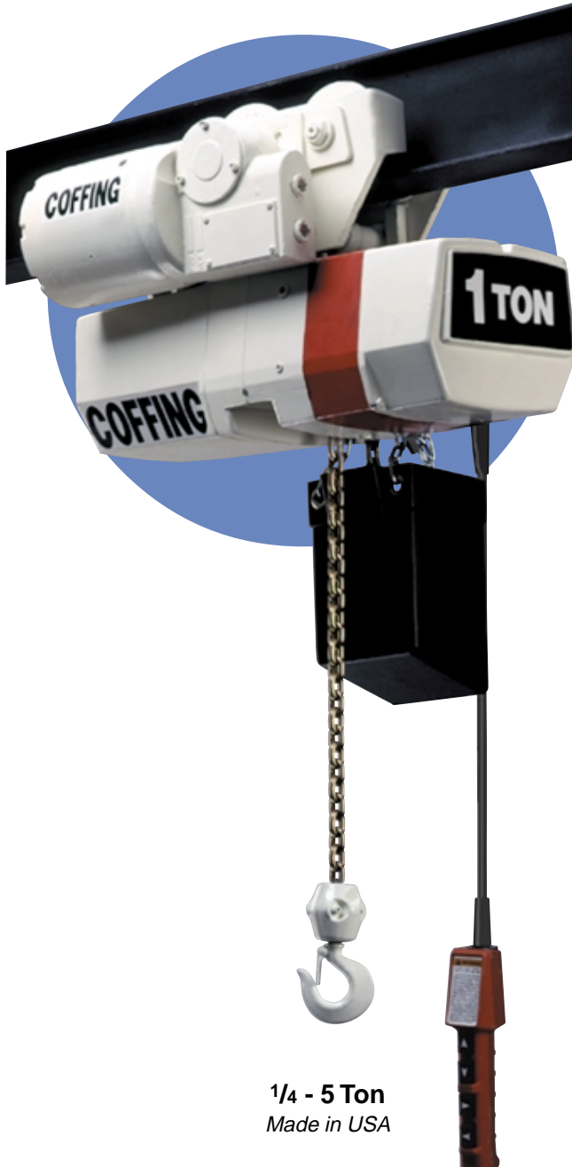
1/4 - 5 Ton Made in USA