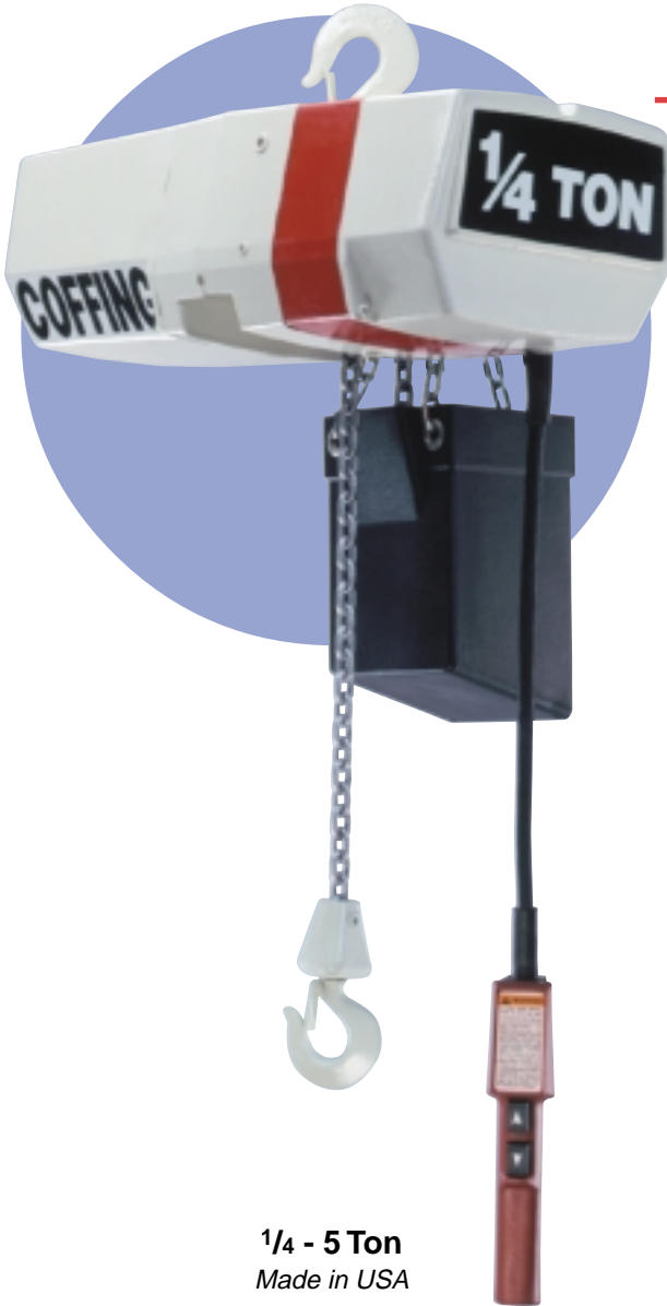
1/4 - 5 Ton Made in USA