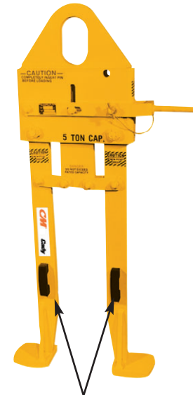
Spacer Blocks Installed for 16-18" coil I.D.'s. See Instruction Manual for details.