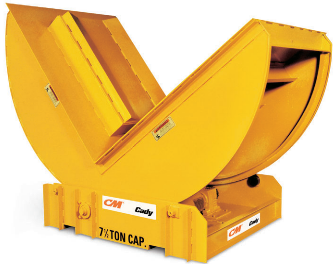
SHOWN WITH V-BLOCK OPTION

NOTE: If load is not a coil, specify center of gravity of load being rotated.