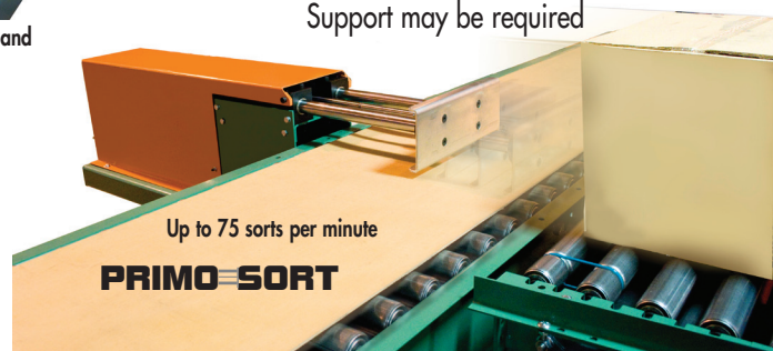
Up to 75 sorts per minute