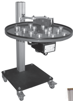
RTA Model 60-024 Single-Column Upright