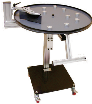
RTA Models 60-032 & 60-048 Telescoping- Column Upright