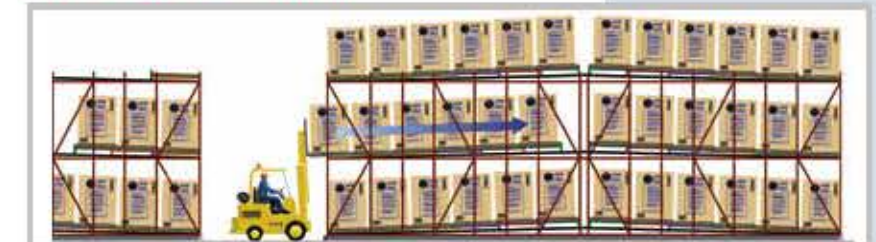
6-DEEP PUSH BACK SYSTEM