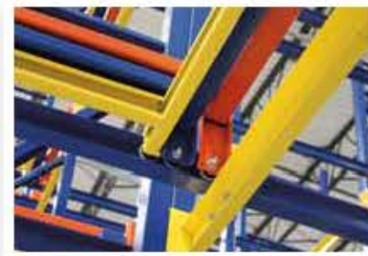
Bottom view of nesting carts

Carts nest together and pallet is loaded onto top cart. The final pallet rests on rails and allows all pallets from behind to come forward when pallet is removed.