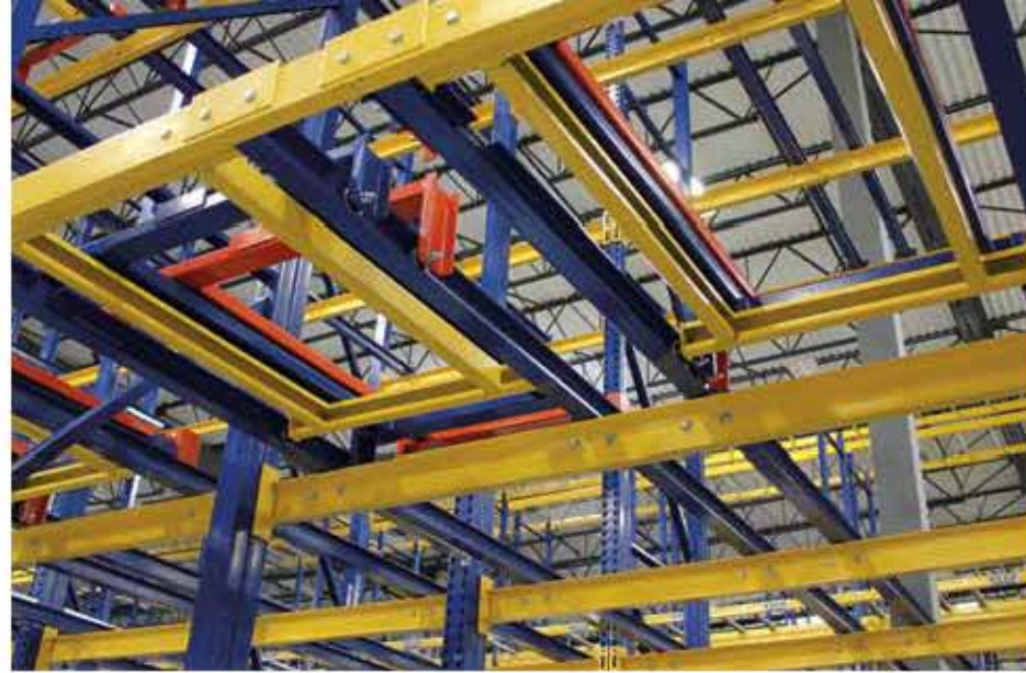
Colored carts let drivers identify pallet positions to help place and retrieve pallets in the system.

Push Back systems work when pallet loads rest on a series of nesting carts. As a pallet is loaded from the front, it pushes the pallet behind it back one position. When it is time to unload (LIFO), the front pallet is removed and the rear pallets come forward to the front picking position, automatically.