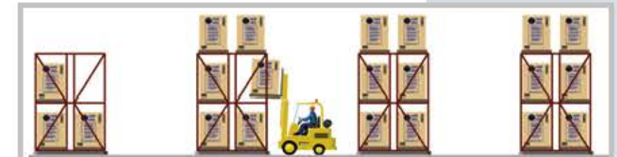
STANDARD PALLET RACK