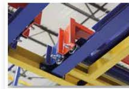
Carts flow automatically on four sealed wheels