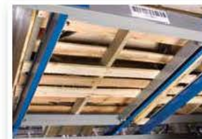
Strong structural sides and rails