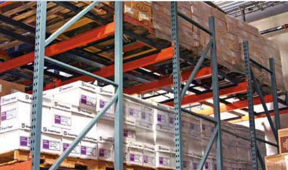
Product loads flow automatically to front picking position.