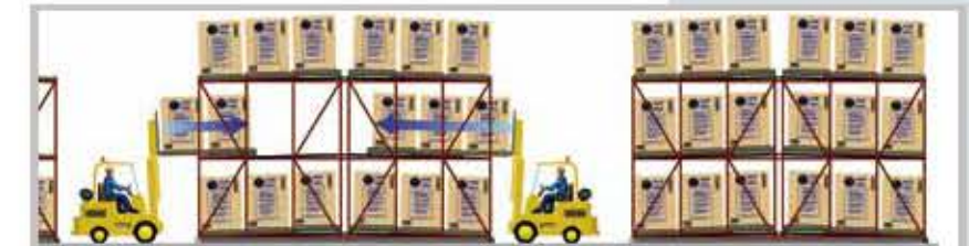
3-DEEP PUSH BACK SYSTEM