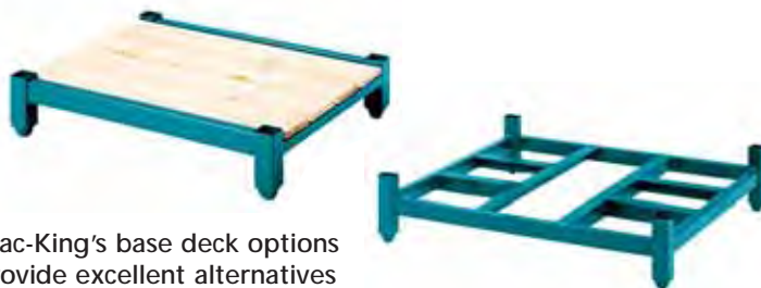
Stac-King's base deck options provide excellent alternatives for various industry applications.