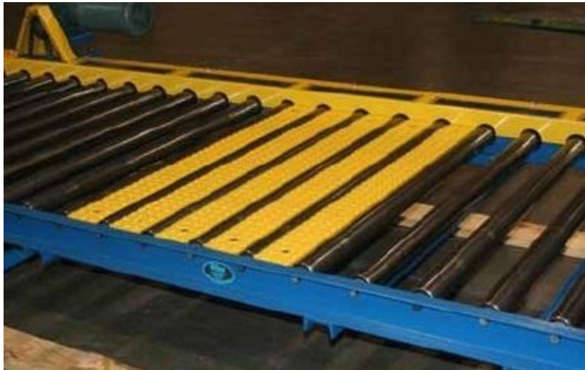
Tread Plates Mounted Between Rollers