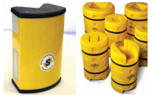
Collision & Column Sentry