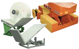
Roll and Coil Handling Products