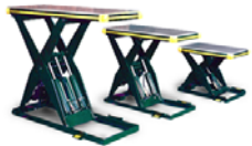
Backsaver Lift Lift Tables