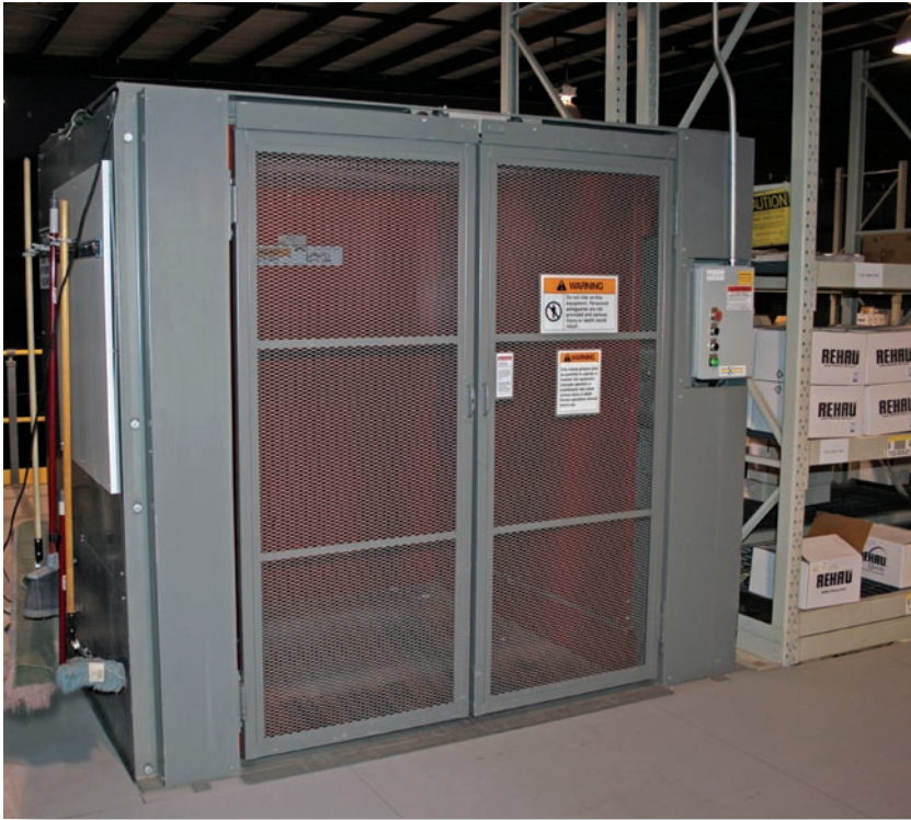
A mechanical straddle Wildeck® VRC allows REHAU employees to transport product efficiently, safely and easily to fulfill customer orders.

Now, the racks are at a manageable height which has made a big improvement in layout and productivity for our people.”