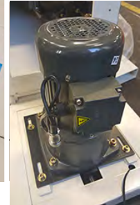
1HP Electric Motor