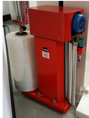
Film Carriage Assembly