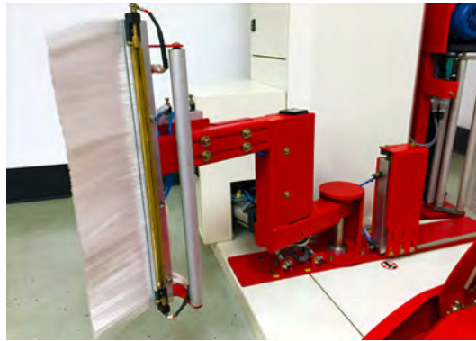
Automatic Film Cut and Wipe Arm

* 3-year parts warranty * (unlimited cycles)