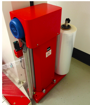
Film Carriage Assembly