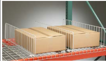
Kwik Klip Dividers