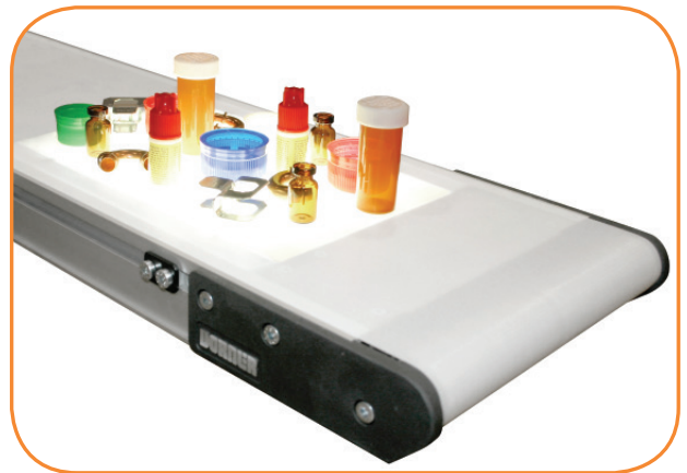
Ideal for a variety of products