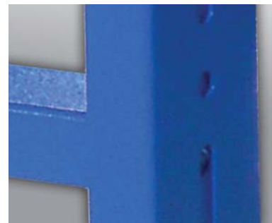
▲ Two Support Options