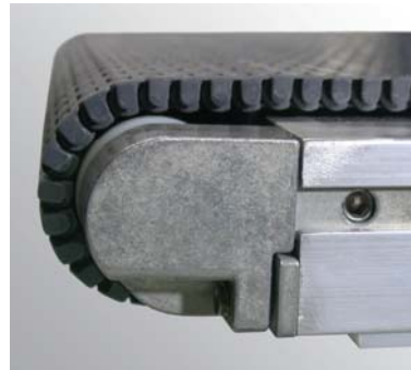
Low Profile Roller Nose

No tensioners, take-ups, or tracking adjustments.