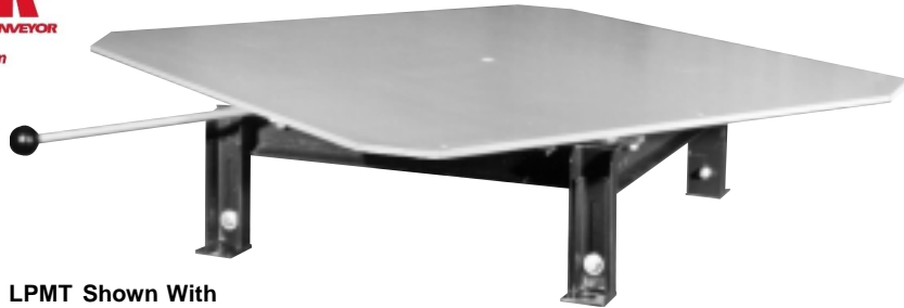
LPMT Shown With Optional Stand

LPMT's are manually operated and can be mounted to any rigid flat surface. Some examples would include scissor lifts, table tops or the floor.