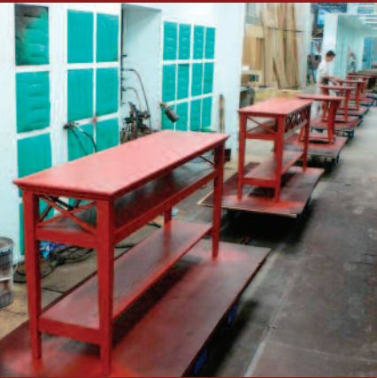
Paint line application