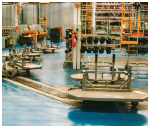
Track mounted in-floor