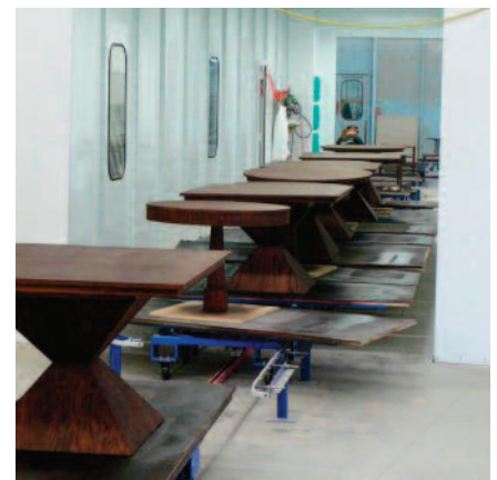
Custom platen with rotator