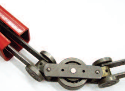
Hardened chain with low-friction bearings