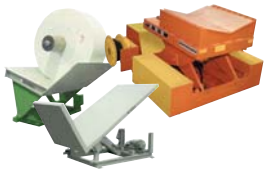
Roll and Coil Handling Products