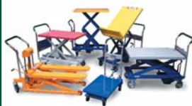
Dandy Lift™ Lifter/Transporter