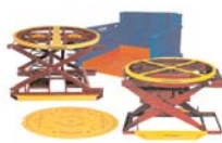
PalletPal® Level Loaders