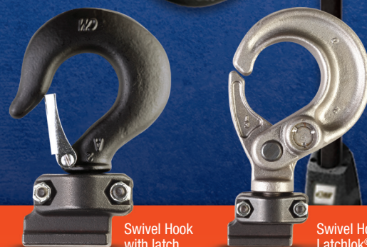
Swivel Hook with latch