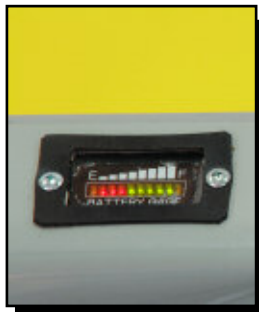
Battery status indicator and onboard charger