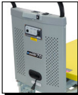
Full shielding of all electrical components