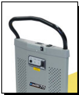
Ergonomic comfort shape handle