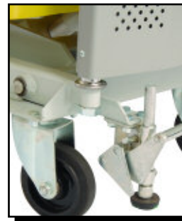
Smooth rolling casters and floor lock