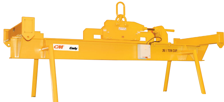
SPECIAL 4-POINT MOTORIZED BEAM WITH LOAD GUIDES.