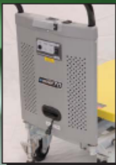
Full shielding of all electrical components