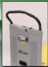
Ergonomic comfort shape handle