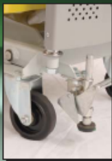
Smooth rolling casters and floor lock