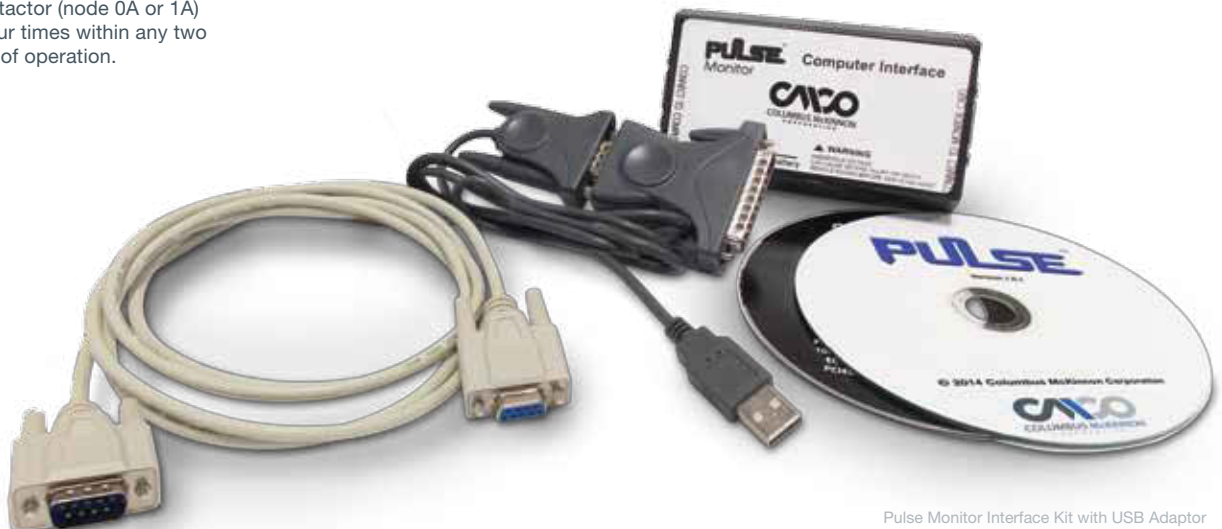
Pulse Monitor Interface Kit with USB Adaptor

For every motor event, the voltage will be measured.