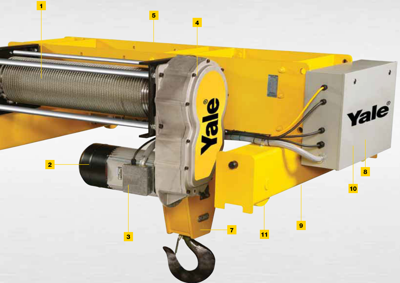
Top-Running Unit Shown Above