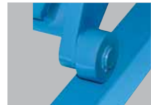
▶ Large Wheels & Pins