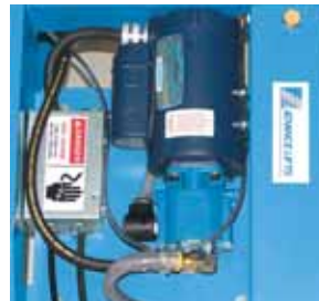
▶ Power Unit