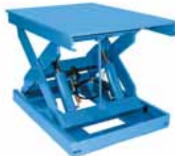
High Cycle (HC) Series 1,000,000 Cycle Warranty