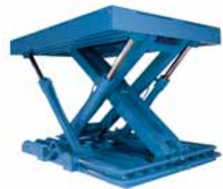
Ultra High Cycle (UHC) Series 3,000,000 Cycle Warranty