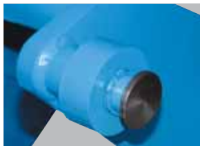
▶ Platform Centering Device