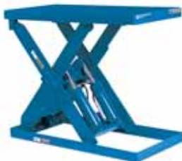
Production (P) Series 250,000 Cycle Warranty