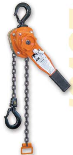
Electric Motor Driven Trolley Capacities 1/4 to 3 Tons