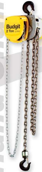
Series USA Hand Chain Capacities 1/4 to 6 tons