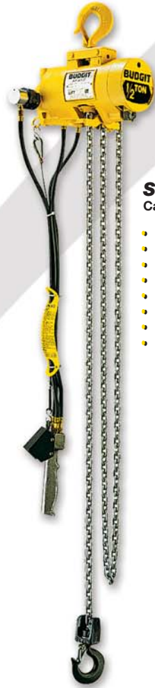
Series 2200 Air Chain Capacities 1/4 to 1 Ton