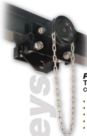
Push-Type or Hand Geared Trolleys Capacities 3/4 to 20 Tons