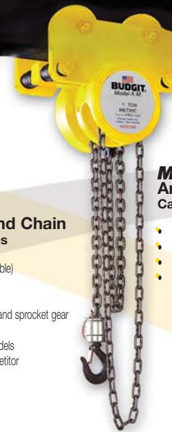
Model AM Army Type Hand Chain Capacities 1/4 to 5 Ton