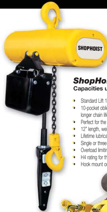
ShopHoist Electric Chain Capacities up to 1000 lbs.