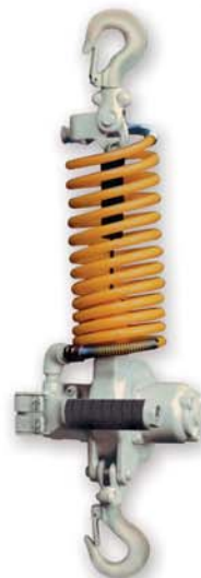
Air Manipulator Hoist Capacities 300lbs / 140 kg