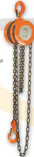
Load Lifter Series 622 Hand Chain Capacities 1/2 to 10 Ton