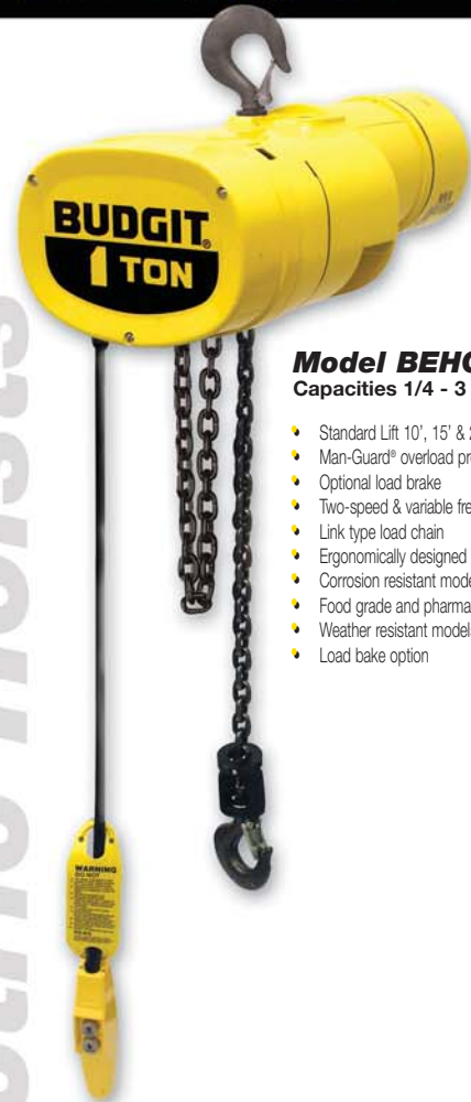
Model BEHC Electric Chain Capacities 1/4 - 3 Tons