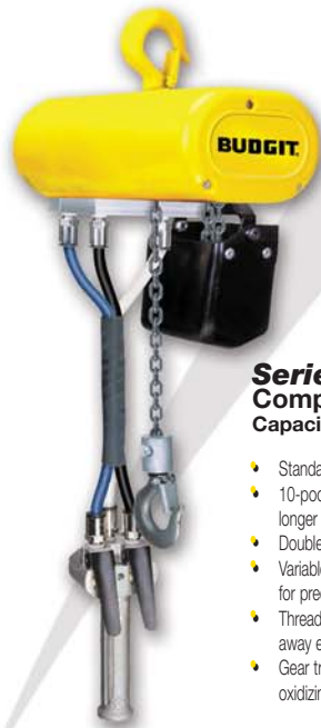
Series 600 Compact Air Chain Capacities 250 to 1000 lbs.