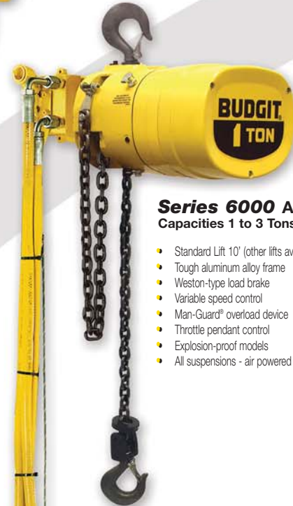
Series 6000 Air Chain Capacities 1 to 3 Tons