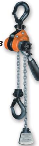
Tugit® Series 602 & 603 Lever Hoist Capacities 550 to 1100 lbs.