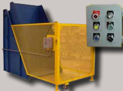
Standard Gated Enclosure - Auto Run Controls Available