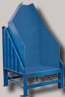
Standard Dumper with Discharge Guides and Elevation Stand