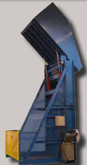
Lift and Dump

For additional information, visit our website: www.endura-veyor.com