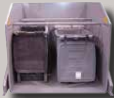
4 Place Cart Dumper