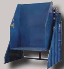
Lift and Dump