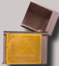
Side Load Dumper