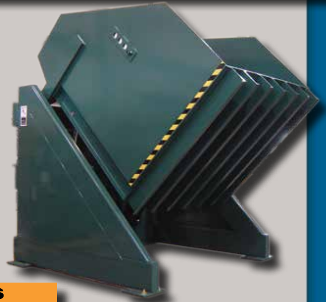
10,000# Rugged Duty Dumper