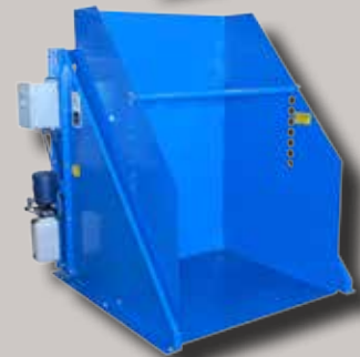
1,000 lb. Dumper