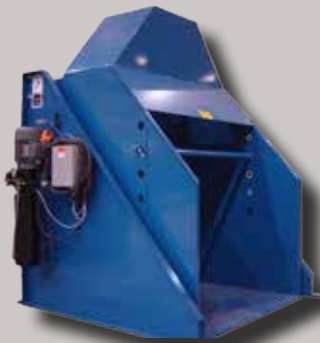
Standard Dumper with Funnel Chute