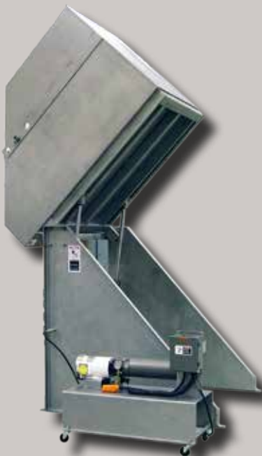
Stainless Steel Dumper