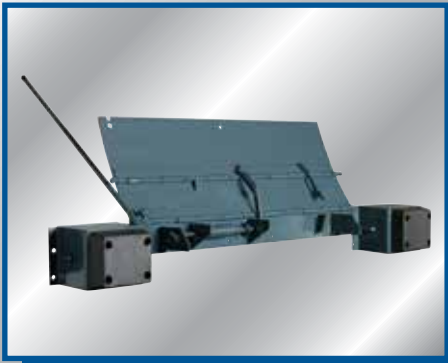
Mechanical Edge-of-Dock Levelers

McGUIRE HAS BEEN THE LEADING ONE-SOURCE MANUFACTURER OF HIGH-QUALITY LOADING DOCK EQUIPMENT FOR OVER 40 YEARS.