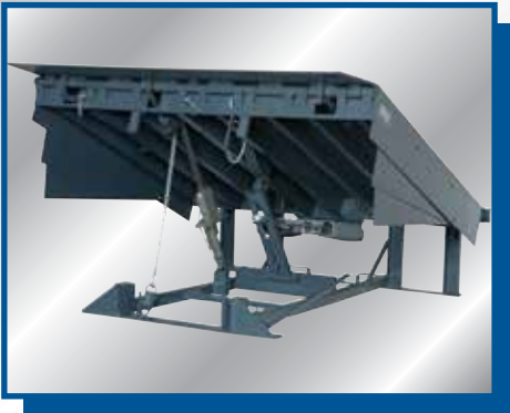
Mechanical Pit Levelers

McGuire is a division of Systems Incorporated located in Germantown, WI.