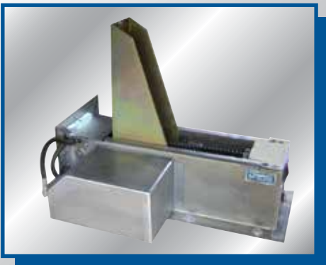
Hold-Tite® Vehicle Restraints

In conjunction with our parent company, Systems Incorporated, our nationwide network of over 400 distributors can satisfy all your loading dock needs.