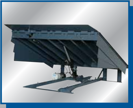
Hydraulic Pit Levelers

McGUIRE HAS BEEN THE LEADING ONE-SOURCE MANUFACTURER OF HIGH-QUALITY LOADING DOCK EQUIPMENT FOR OVER 40 YEARS.