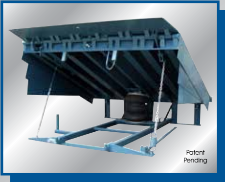
CentraAir® Air Powered Pit Levelers