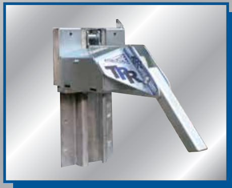
TPR® Vehicle Restraints