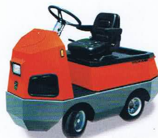
TOW TRACTORS "TT"