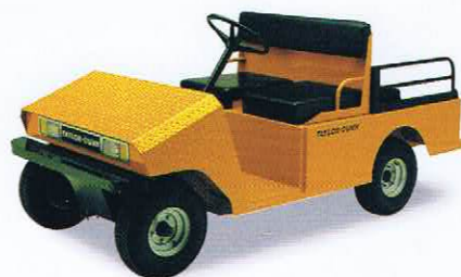
PERSONNEL CARRIERS "PC"