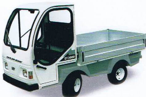
UTILITY VEHICLES "UV"