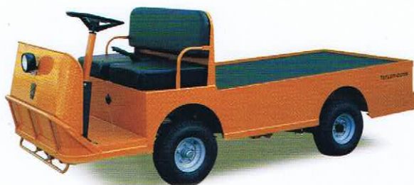
BURDEN CARRIERS "BC"