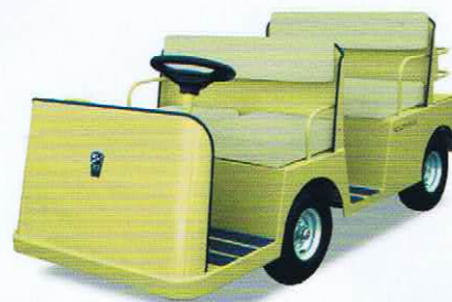
COMMERCIAL VEHICLES "CV"