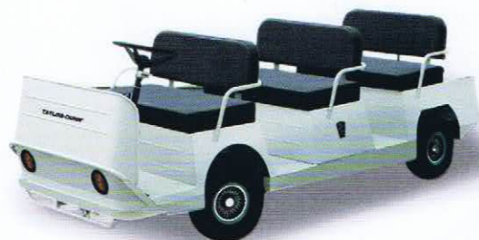
ELECTRIC TRAMS "ET"