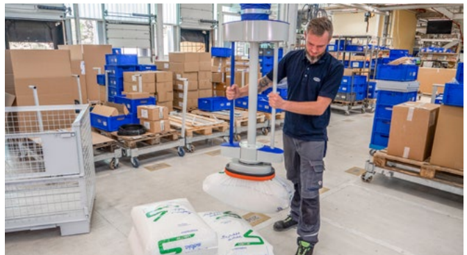
Jumbo Low-Stack when handling bags