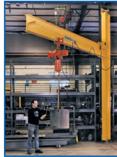
Spanco 201-Series Mast-Style Drop-Cantilever Jib Cranes are similar to the 200-Series Full-Cantilever Jib Cranes, with the addition of side-plate connections to "drop mount" the boom permanently at a specified height on the mast. This design allows for clearance from overhead obstructions located below the top of the mast.