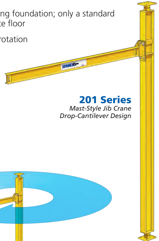
201 Series Mast-Style Jib Crane Drop-Cantilever Design