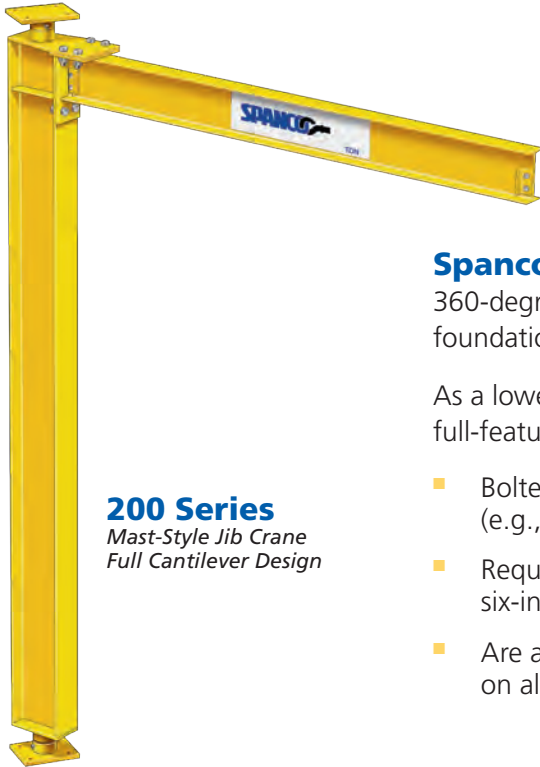
200 Series Mast-Style Jib Crane Full Cantilever Design

Spanco Mast-Mounted Jib Cranes provide full 360-degree rotation while eliminating the cost of a special foundation, which can cost more than the crane.