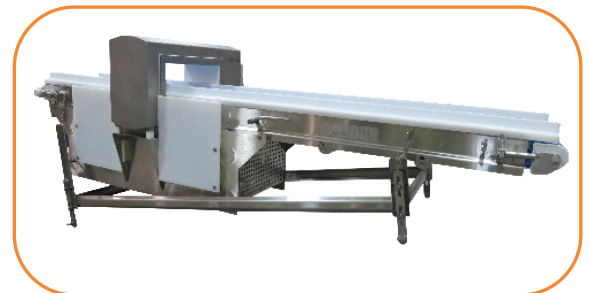
Also available on Dorner 3200 Series, AquaGard, and AquaPruf Conveyors

DORNER MFG. CORP. PO Box 20 • 975 Cottonwood Ave. Hartland, WI 53029 USA