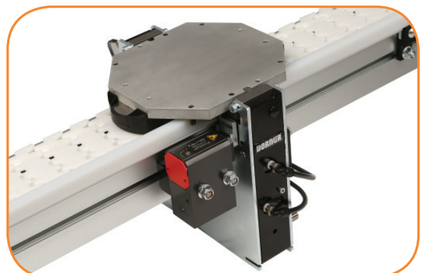
Lift & Locate