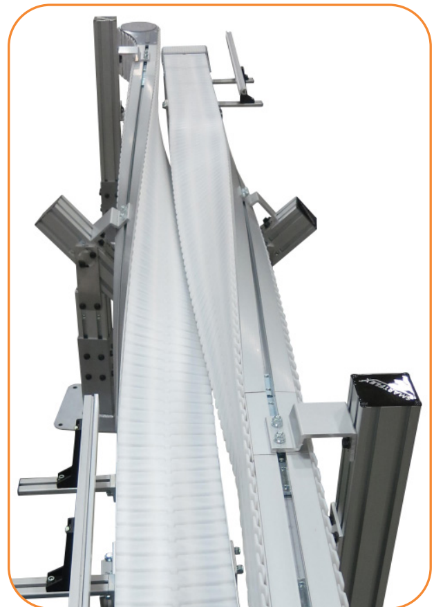
Helical Twist up to 90 Degrees