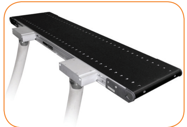
Can be Used with a Variety of Vacuum Sources